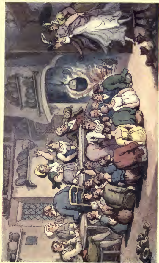
HUNTING THE SLIPPER