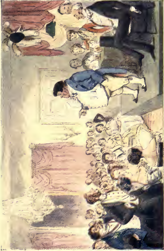
MR. TORROCK'S LECTURE ON "UNTING"