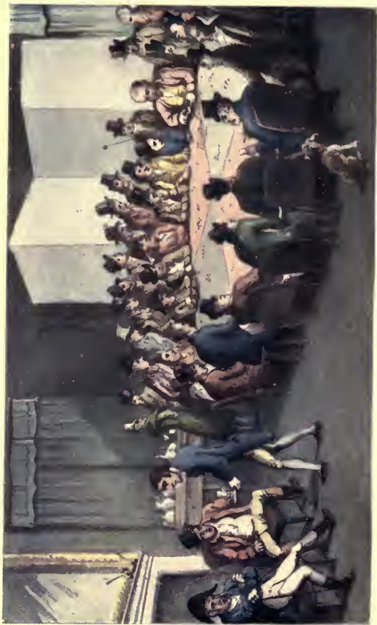
QUE GEN'S OFFICIATING AT A GAMING HOUSE