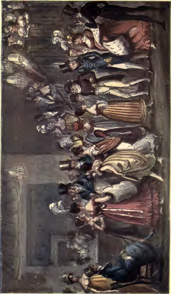
TOM AND JERRY, IN THE SALOON AT COVENT GARDEN