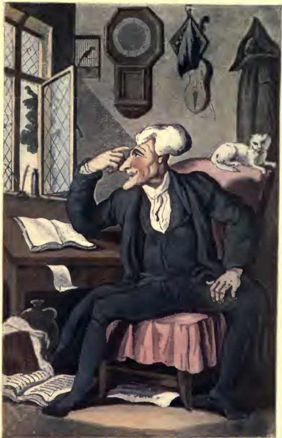
THE REV'D. DOCTOR SYNTAX