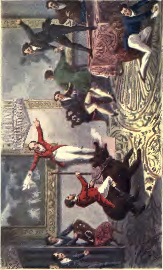
A NEW HUNTER—TALLYHO! TALLYHO!