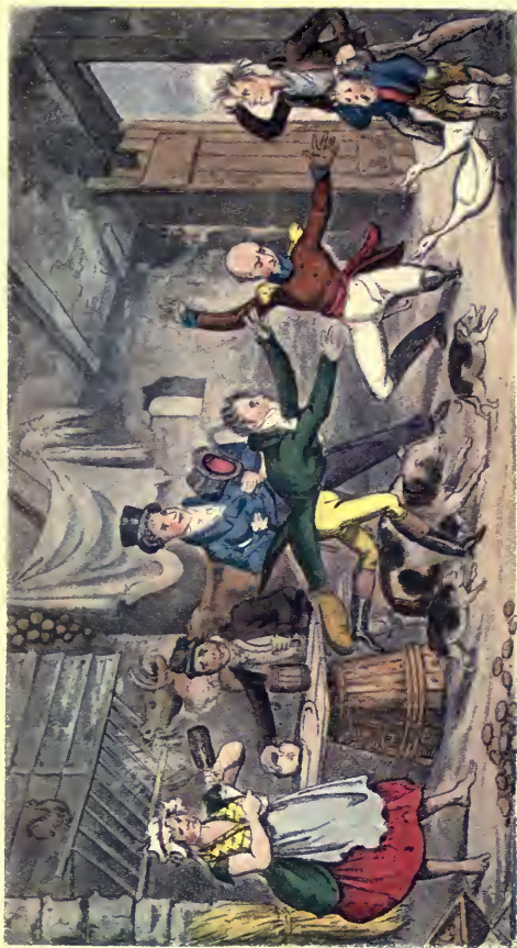
ADVENTURES IN A WHISKEY PARLOUR