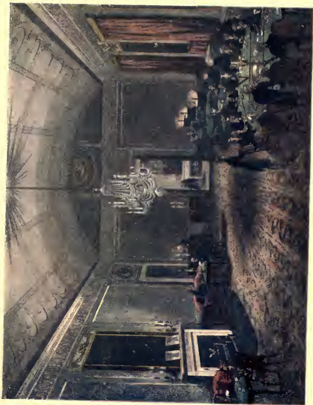
SUBSCRIPTION ROOM AT BROOKS