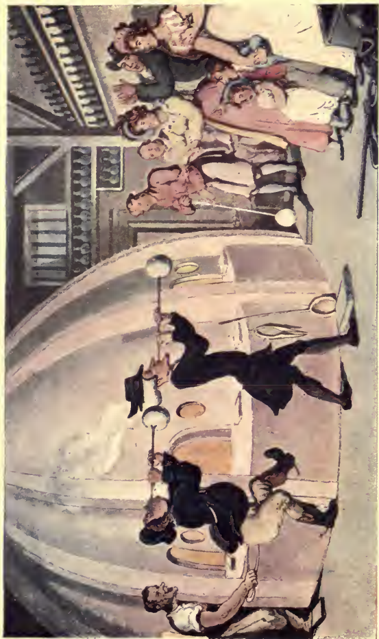
DR. SYNTAX IN THE GLASS HOUSE