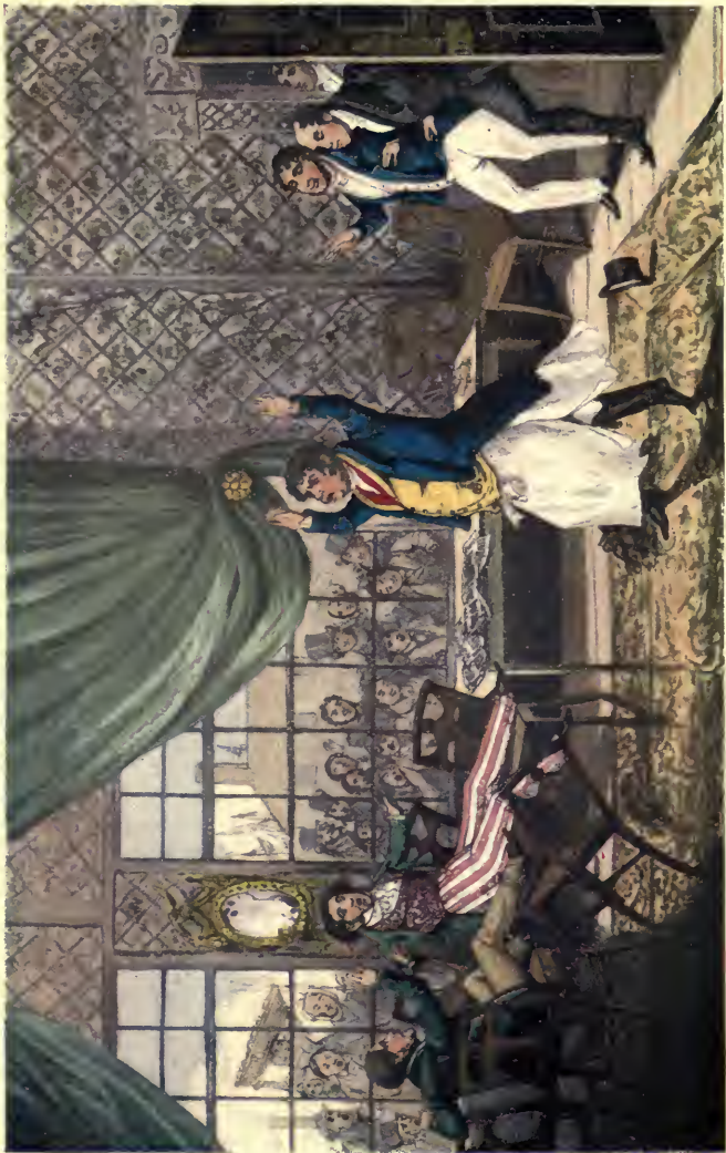
"OH GENTLEMEN! GENTLEMEN! HERE'S A LAMENTABLE OCCURRENCE!"