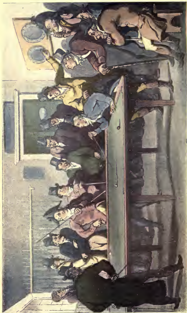
By Gamblers link'd in Folly's Noose, Play ill or well, he's sure to lose.